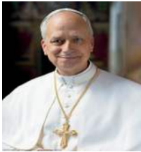
(Pope’s Worldwide Prayer Network)

“Lord of Life, you shaped every human being in your image and likeness. We believe you created us for communion, not for war, for fraternity, not for destruction. You who greeted your disciples saying, “Peace be with you,” grant us the gift of your peace and the strength to make it a reality in history. Today we lift up our prayer for peace in the world, asking that nations renounce weapons and choose the path of dialogue and diplomacy.”